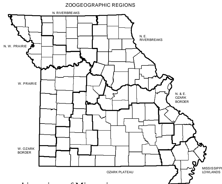
FIGURE 1. Zoogeographic regions of Missouri.